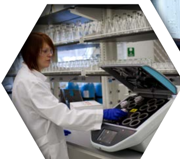
Lab and bench-scale tests